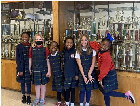
Sabre Clean-up Crew

Each month we concentrate on a virtue and look for that virtue in our students. October's virtue is studiousness. Studiousness means to seek knowledge to grow closer to God. We read, learn, and experience new things in order to become educated and be studious. We will look for students in our homerooms that exhibit this virtue and we will celebrate those students that demonstrate it most at the last Mass of the month.